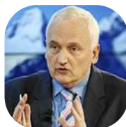
Nik Gowing Independent TV Anchor