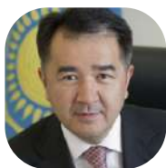
Bakhytzhhan Sagintayev Prime Minister of Kazakhstan (Sep 2016 – Feb 2019)