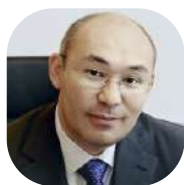
Kairat Kelimbetov Governor of Astana International Financial Centre