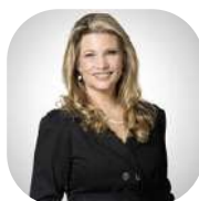
Oriel Morrison Co-anchor, CNBC's Street Signs (Singapore)