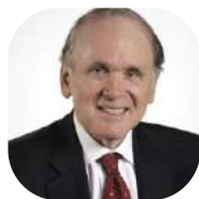
Daniel Yergin Vice Chairman of IHS Markit, American economist, winner of the Pulitzer Prize