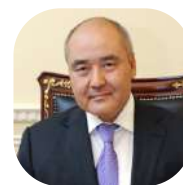
Umirzak Shukeyev Deputy Prime Minister - Minister of Agriculture of Kazakhstan (Dec 2017 - Feb 2019)