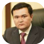
Zhenis Kassymbek Minister of Investments and Development of Kazakhstan (Jun 2016 – Feb 2019)