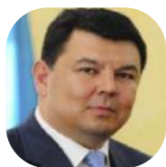
Kanat Bozumbayev Minister of Energy of Kazakhstan